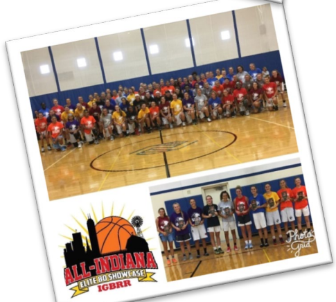
ALL – INDIANA SHOWCASE August 16th