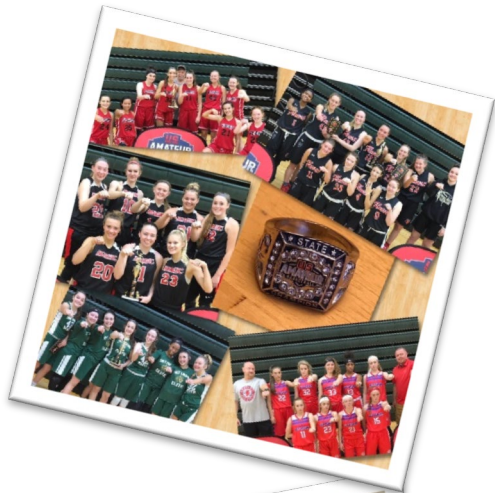
IGBRR May Day Tournament May 1-3rd