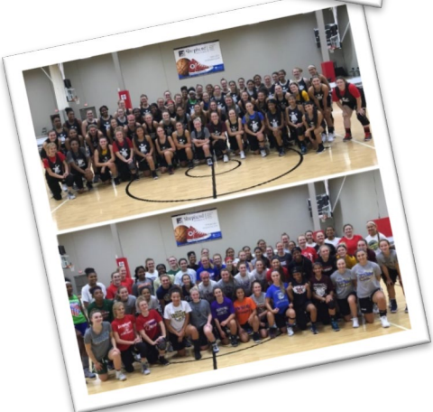
PRE-SEASON SHOWCASE September 27th