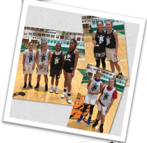
Indiana Futures Camp August 30th